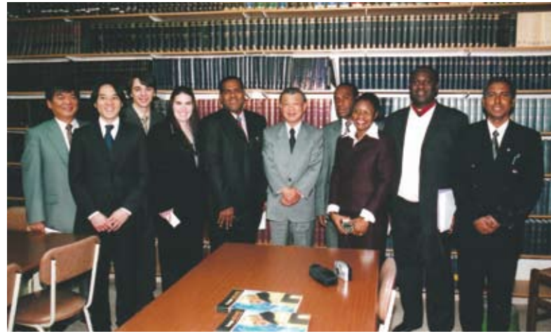
Mr. Yohei Sasakawa ( Chairman, Nippon Foundation ) with the Nippon Scholars of the IMLI Class of 2003-2004.

IMLI and the Nippon Foundation established in 2003 a joint project entitled "Human Resources Development Project for the Advancement of a More Effective Global Legal Order for the Oceans". Mr. Yohei Sasakawa, Chairman of The Nippon Foundation, accompanied by a high-level Delegation of Executives paid an official visit to IMLI on 26 March 2004 for the official launching of the Project.