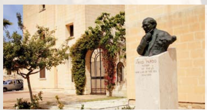
The monument of Ambassador Arvid Pardo, father of the new law of the sea