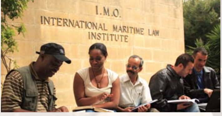
Students at the entrance of their residential area