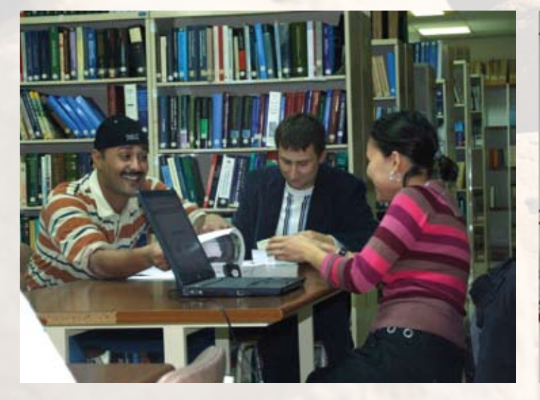
The IMLI Library has a comprehensive collection of books, law reports and periodicals