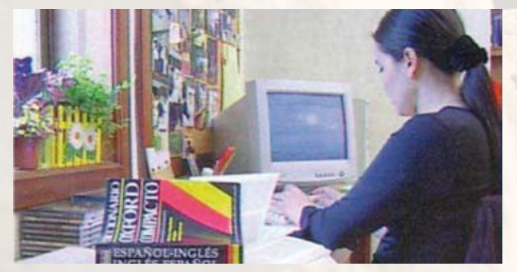
Apartments at IMLI are equipped with a personal computer through which students are able to have unlimited internet access