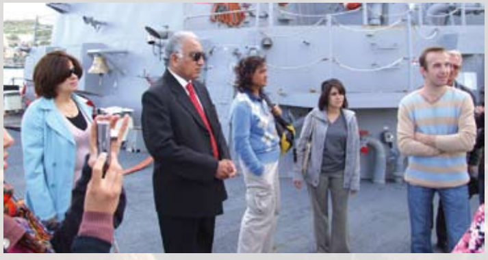
IMLI students during a visit to a Navy Ship of the United States of America

There is a students' Common Room on the Institute's premises equipped with television, DVD Player, recreational reading material and some games. Students may be assigned certain duties relating to their academic and residential life at the Institute. Students can also use the available facilities of the University of Malta, which include some sports facilities.