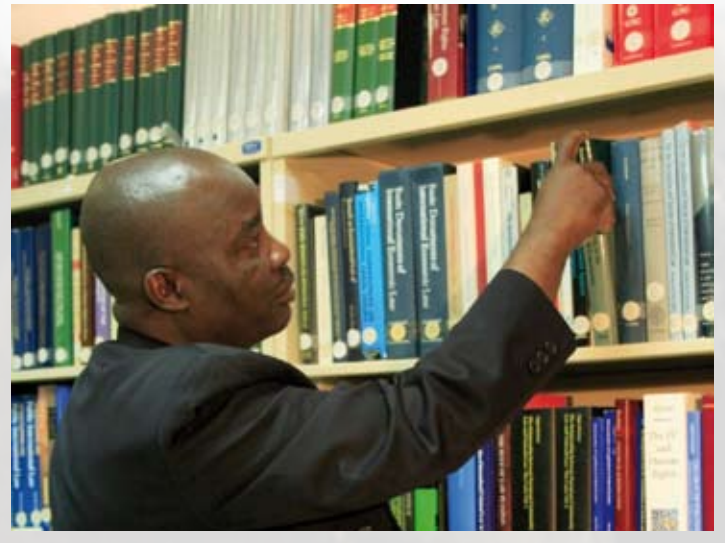
The IMLI Library has evolved into one of the leading specialized research libraries in the field of international maritime law