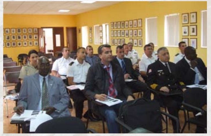
On request of the Armed Forces of Malta IMLI organized in 2009 a course on the Law of the Sea which was attended by participants from different European and African countries

Teaching at IMLI on the LL.M. programme is based on the modular system. It is therefore possible for a small number of applicants to attend these modules as self-contained courses. These courses are open to non-lawyers. IMLI has also often been required by governmental and international bodies to organize specific short-term courses, which focus on subjects covered by its academic syllabus. In such cases, courses are tailor made to meet the specific requirements of the organizers and bring them the latest developments of the law in their areas of interest. Short courses are periodically announced on IMLI's website and through the IMLI e-newsletter.