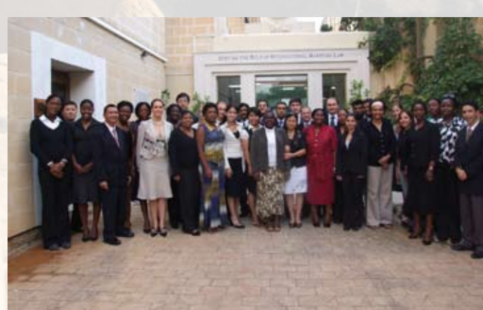
Class of 2007/2008