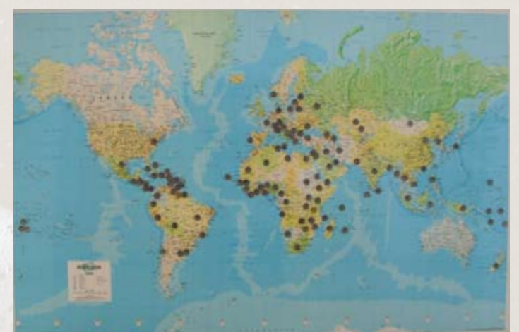
IMLI's map represents the countries of origin of IMLI students