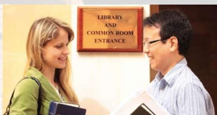
Students in front of IMLI's Common Room