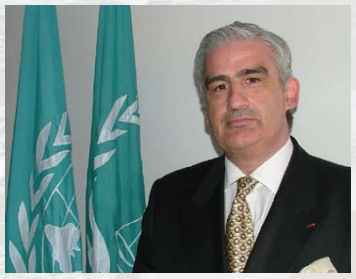
Diploma in International Maritime Law. This programme launched in 2005 is based on a credit system offering a large degree of flexibility for candidates who may carry out their studies between one and five academic years.

Considering the growing demand for training in international maritime law by professionals who are not in possession of the first law Degree required by the LL.M. programme or by lawyers who are unable to be away from their jobs for a whole academic year, the Institute designed the programme leading to an Advanced