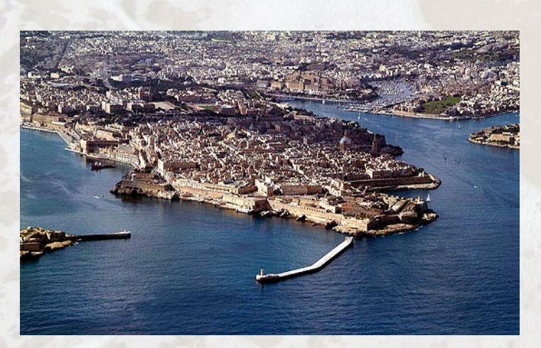
Aerial view of Valletta

Malta's maritime role has ensured that the study and practice of maritime law has flourished amongst the island's legal profession. Indeed, it is this legal tradition which contributed to the formulation of the Maltese initiative at the 1967 United Nations General Assembly that culminated in the adoption of the 1982 United Nations Convention on the Law of the Sea. Malta also hosts the Regional Marine Pollution Emergency Response Centre for the Mediterranean Sea (REMPEC), established under the Mediterranean Action Plan of UNEP and administered by IMO.