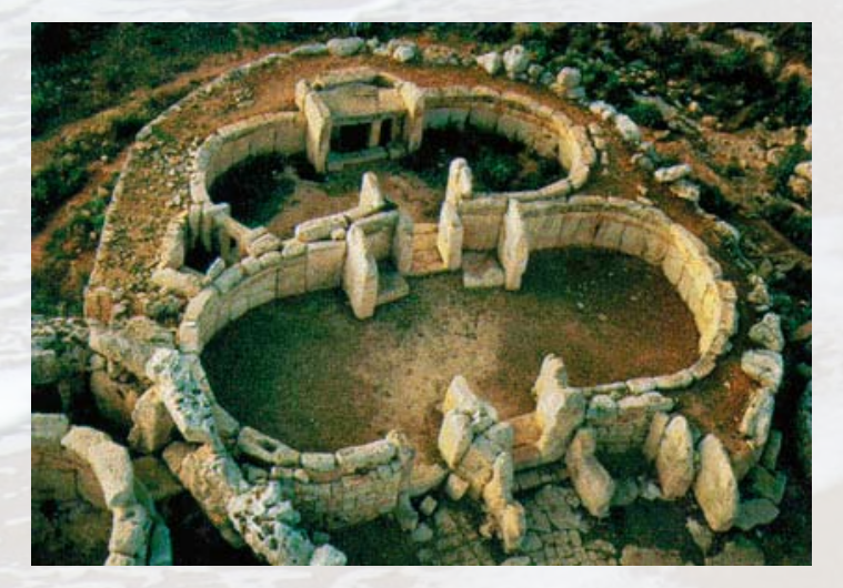
View of Megalithic Temples, Tarxien

Within the Mediterranean, maritime navigation, trade and commerce have flourished under the influence of widely accepted and respected rules of maritime law, at times codified, as in the "Consolato del Mare". Malta's maritime role has ensured that the study and practice of maritime law has flourished amongst the island's legal profession.