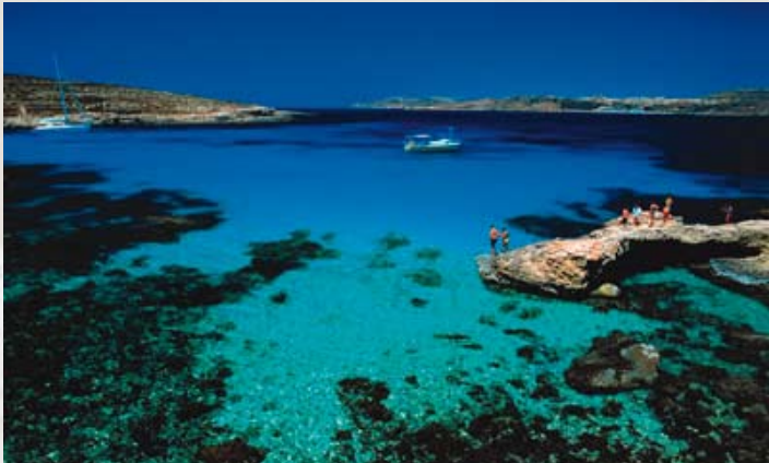
Blue Lagoon, Comino Island