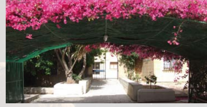
IMLI's residential area entrance