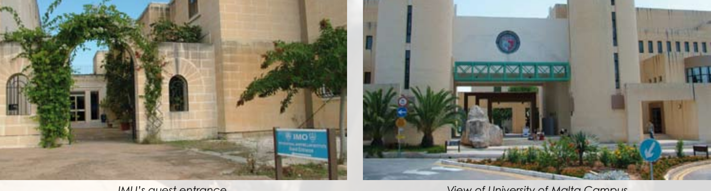
IMLI's guest entrance

The fee shall be payable upon admission to the programme. The programme fee should be remitted to the Institute's bank account.