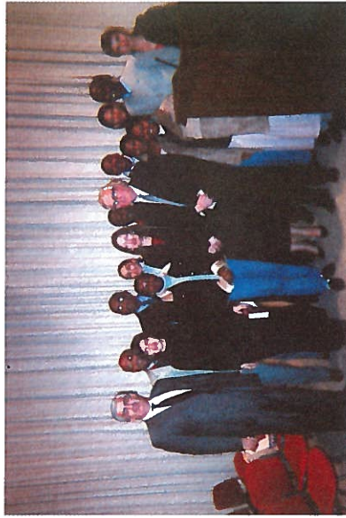
Professor Ian Brownie (Professor Emeritus, University of Oxford) with Professor Attard and members of the Class of 2001/2002 after a lecture sponsored by IMLI and The Law Society, Malta