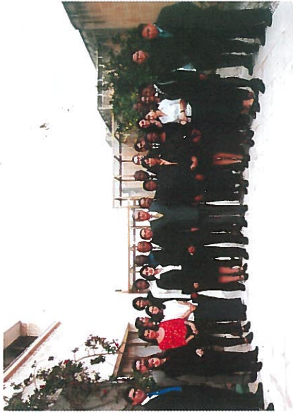
IMLI's Staff and the Class of 2001/2002