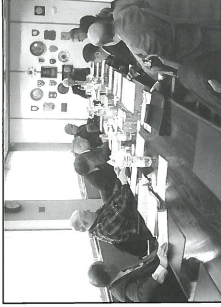
16th Session of IMLI's Governing Board held at the IMO Headquarters, London, on 21st March 2002

Vice-President, Comité Maritime International, Proctor and Advocate in Admiralty, U.S.A.