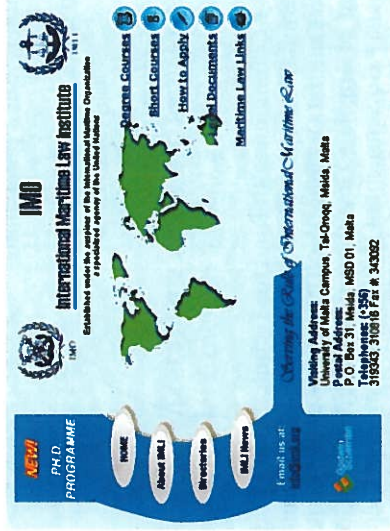
IMLI's website www.imli.org