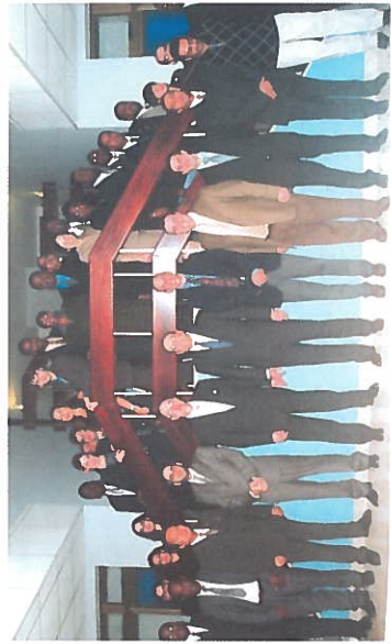
IMLI Class of 2003/2004 with a U.S. Delegation and IMLI Lecturers at the Seminar on Maritime Enforcement