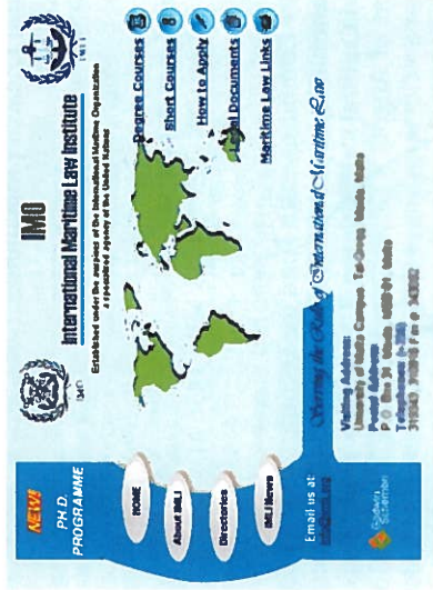
IMLI's website www.imli.org