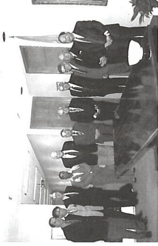
H.E. Mr. E. E. Mitropoulos (Secretary-General, IMO) with Members of IMLI's Governing Board during the Board's 18th Session held at the IMO Headquarters, London, on the 26th April 2004.

Vice-President, Comité Maritime International; Proctor and Advocate in Admiralty, U.S.A.