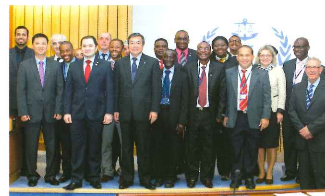
Mr. Koji Sekimizu (Secretary-General, IMO) with IMLI graduates representing their countries and distinguished personalities attending IMLI's 25th Anniversary Commemorative Seminar