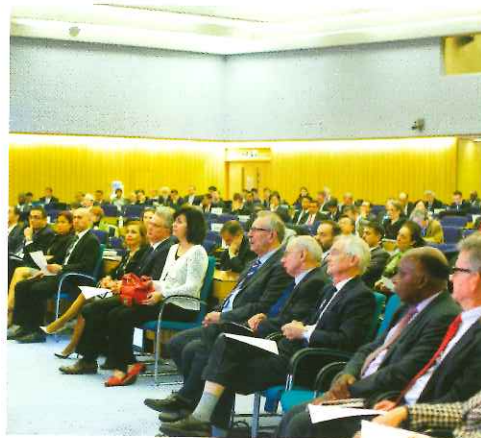
Distinguished guests attending the seminar