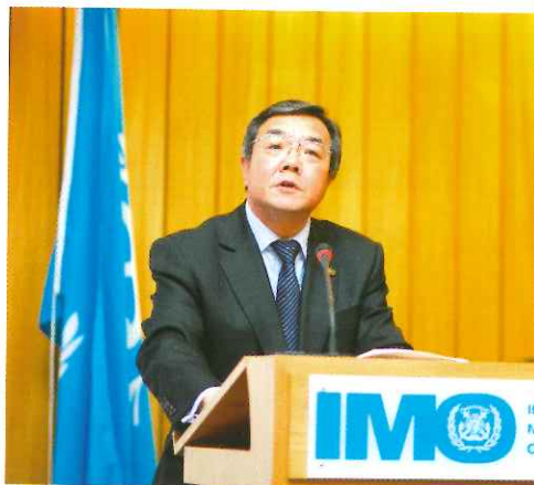
Mr. Koji Sekimizu (Secretary-General, IMO) delivering the keynote address at IMLI's 25 th Anniversary Commemorative Seminar at IMO