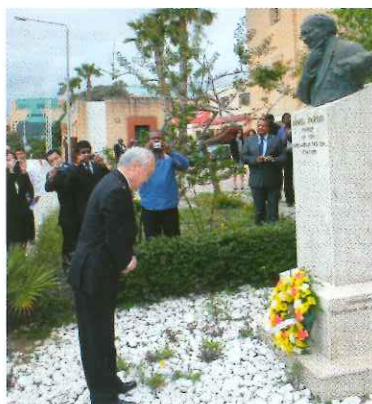
Judge Shunji Yanai (President, ITLOS) placing a wreath of flowers before the monument of Arvid Pardo