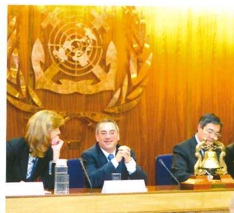
The Honourable Joe Mizzi M.P. (Minister for Transport and Infrastructure, Malta) was a member of the Panel of Speakers at the Seminar