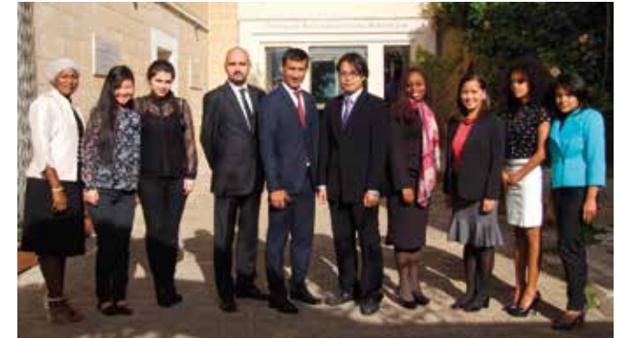
The Nippon Foundation Scholars