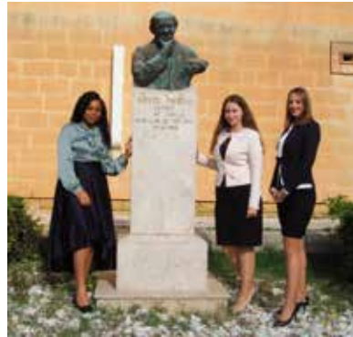
Lloyd's Register Foundation Scholars