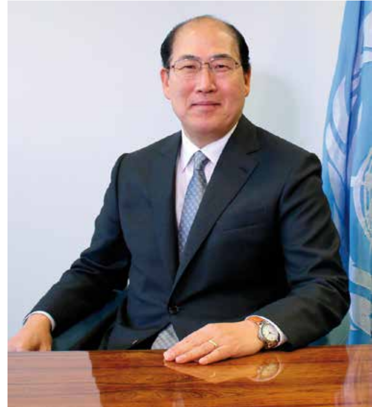
Mr. Kitack Lim Secretary-General, IMO

Today is a time for celebration and contemplation, of reflecting and looking onward to how this successful period will help to foster new opportunities for the future. I wish all the graduates every success in their future endeavours, and I very much look forward to meeting many of them in a professional capacity in the coming years.