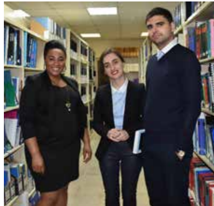
The Lloyd's Register Foundation Scholars