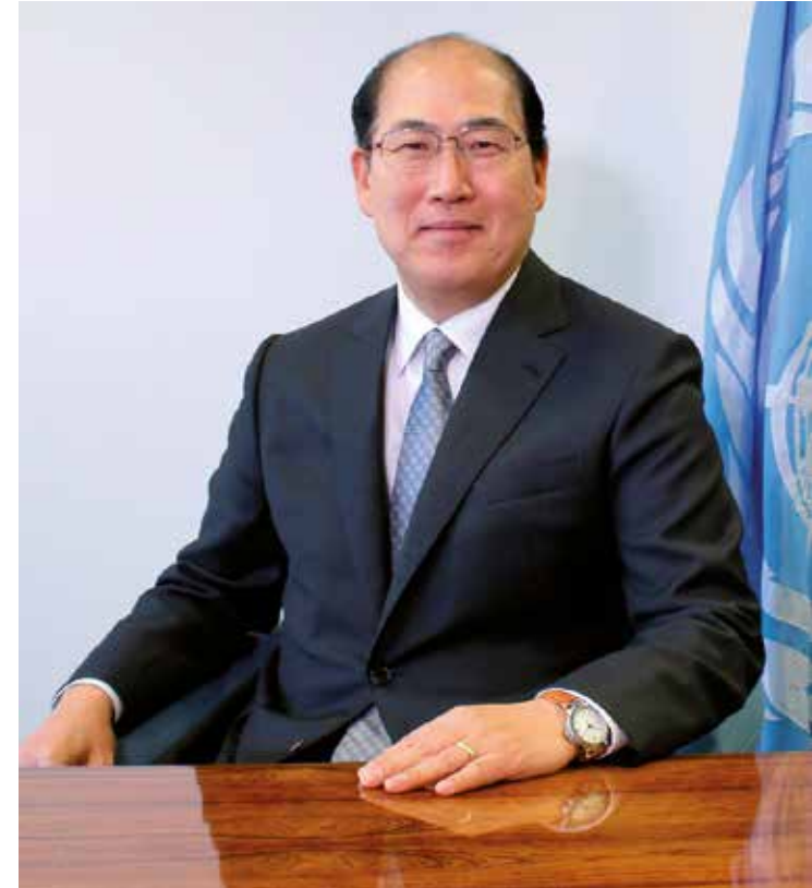
Mr. Kitack Lim Secretary-General, IMO Chairman, IMLI Governing Board

Today is a time for celebration and contemplation, of reflecting and looking onward to how your success at IMLI will offer a springboard for new opportunities. I wish all the graduates every success in their future endeavours, and I very much look forward to meeting many of them in a professional capacity in the coming years.