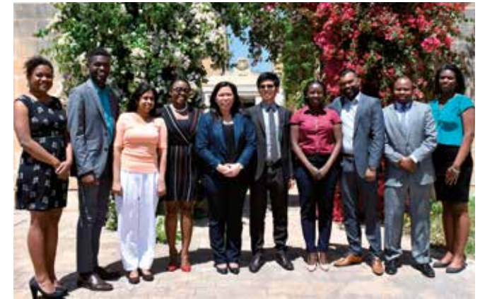
The Nippon Foundation Scholars