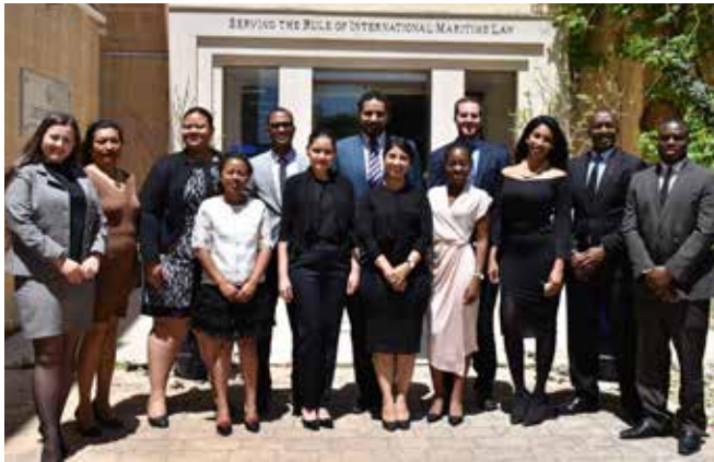
The IMO Scholars