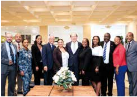
Mr. Kitack Lim (Secretary-General, IMO) with Symposium participants including WMU and IMLI graduates at a High-Level Symposium in Jamaica