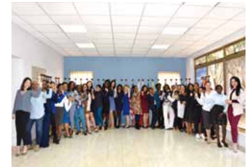
IMLI Ladies empowered through training at IMLI