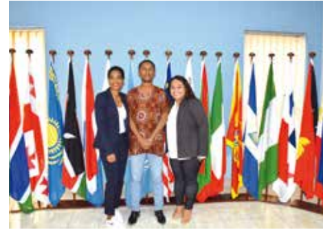
Lloyd's Register Foundation Fellows