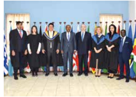
His Excellency Judge Abdulqawi A. Yusuf (President, International Court of Justice) and IMLI Staff