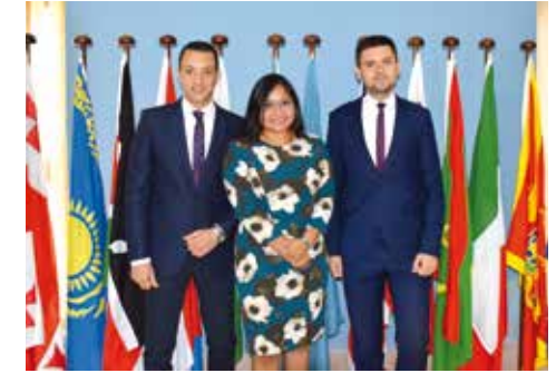
ITF Seafarers' Trust Fellows