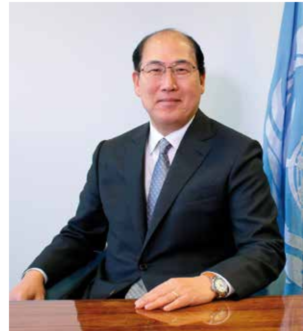
Mr. Kitack Lim Secretary-General, IMO Chairman, IMLI Governing Board