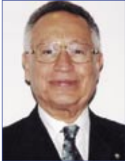
HE Mr. Efthimios Mitropoulos (Secretary-General, IMO)

– the 16 th generation of students to attend since the Institute was established in 1989.