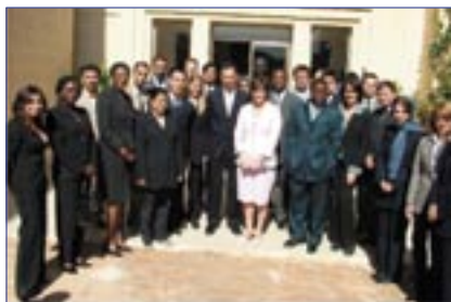
Ms. Cherie Booth Q.C. with IMLI class 2004/2005