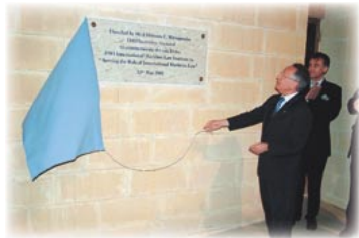
Mr. Efthimios Mitropoulos (Secretary – General, IMO) unveiling the plaque commemorating the role of IMLI in "Serving the Rule of International Maritime Law" (13 th May 2005)

None of this would be possible without the generous hostship facilities provided by the Government of Malta and the continued support of the Malta Maritime Authority – I offer them both my sincere thanks for all these and, also, for the contribution of Malta, as one of the world's major registers and an IMO Council Member, to the overall work of the Organization. Malta's contribution to