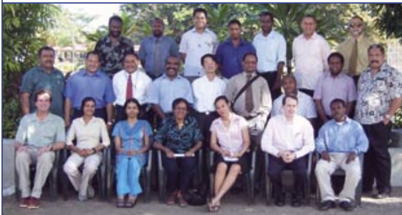
IMLI graduates from the Pacific area and other guests at the IMLI Alumni/Maritime Legal Seminar held in Suva, Fiji between the 12 th and 15 th July 2005.

IMLI Graduates from the Pacific Region have recently established the Pacific International Maritime Law Association (PIMLA). The new association was officially formed at the IMLI Alumni/Maritime Legal Seminar held in Suva – Fiji (under the auspices of the Secretariat of the Pacific Community) and is the product of intensive discussions and initiatives by IMLI graduates from the Pacific area.