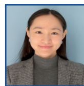
Ma Lin (CHINA)