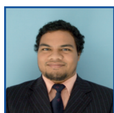
Simon Kofe (TUVALU)