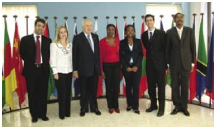
Former President of Portugal, His Excellency, Dr. Mario Soares, with students from Portuguese-speaking countries