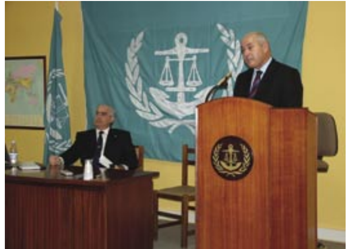
Minister for Competitiveness and Communications, The Honorable Censu Galea, addresses the Class of 2006-2007 on the occasion of World Maritime Day 2006

"Maritime activity has a key role to play in the eradication of extreme poverty and hunger. It already provides an important source of income and employment for many developing countries through