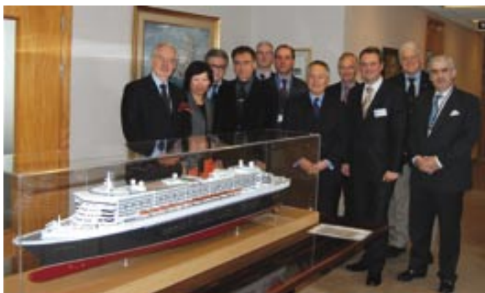
IMO Secretary-General, Mr. Eftimios Mitropoulos, with Members of the IMLI Governing Board

"A final note that concerns you as future alumni of this Institute, I am sure that your varied experiences will, during the coming months, help you both individually and as a group, to broaden your maritime experiences. Within a few months you will all be better prepared to face the challenges that maritime activities bring about, sometimes unexpectedly."