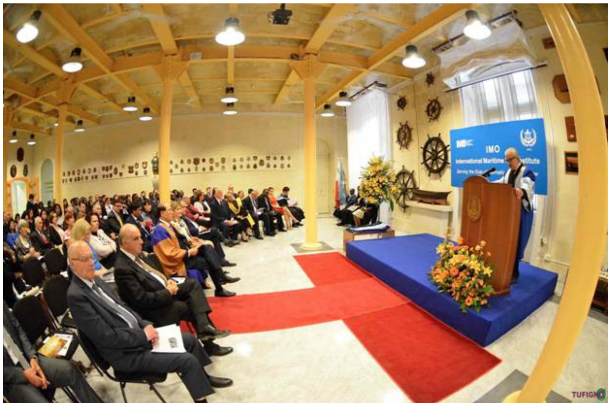
The graduation ceremony