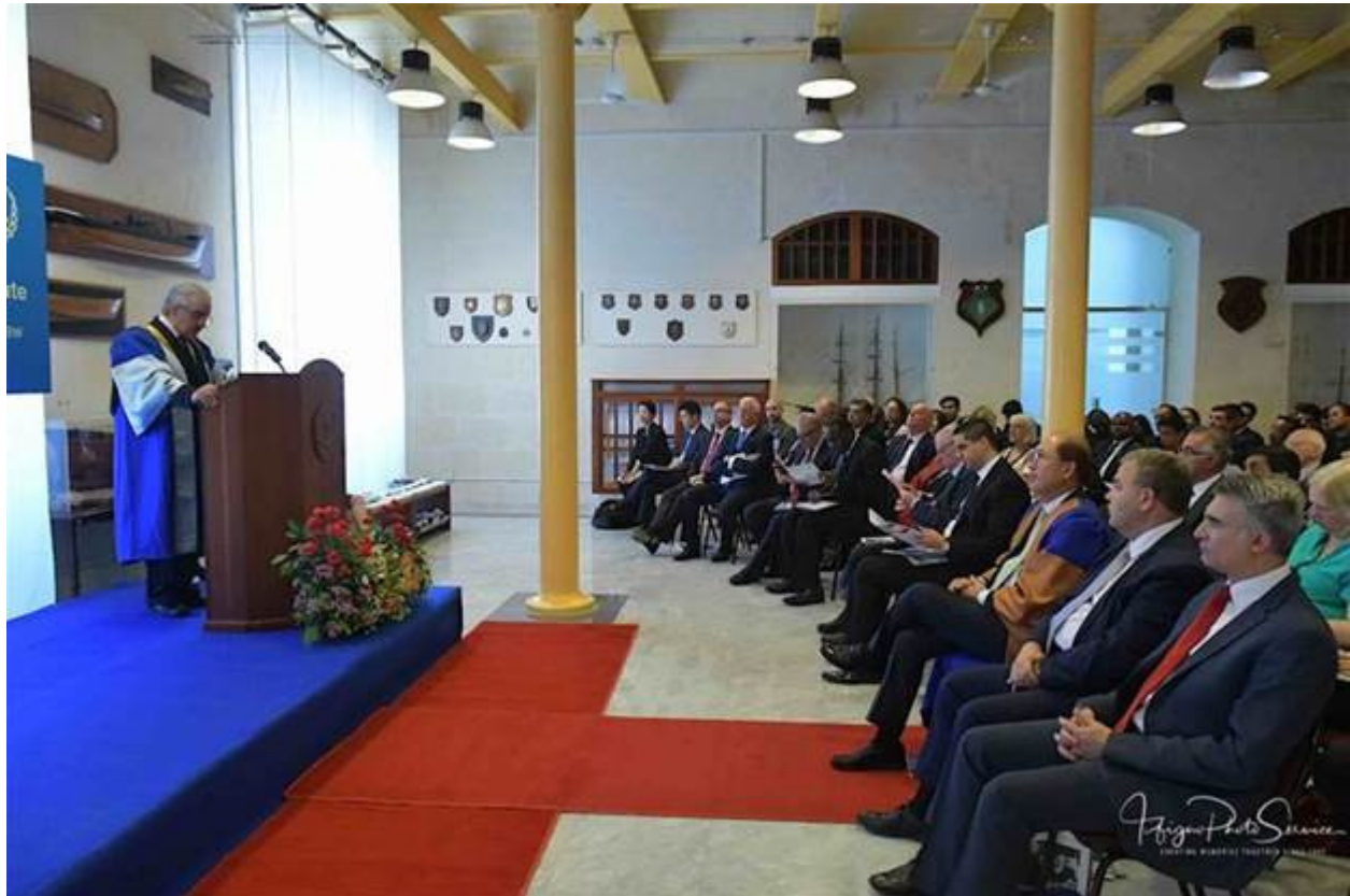
The graduation ceremony