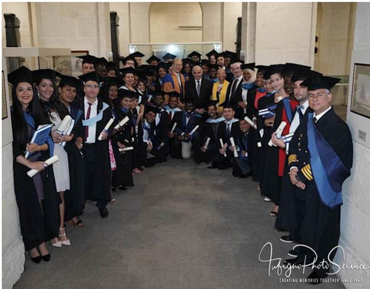
Group photo with Students

In his address, the Secretary-General informed the gathering that the graduation is a testament to IMLI's continuous support to the capacity building needs of IMO Member States in the sphere of international maritime law. He stated that IMLI has trained over 1000 graduates from 146 countries, to date, through its educational programmes. He likewise stated that IMLI has made noteworthy efforts to reduce gender disparities in maritime education, by encouraging equal access to specialised maritime training to qualified female candidates. This is undoubtedly evident with IMLI being the first institution within the UN system to reserve 50 per cent of places of its programmes for deserving female candidates.