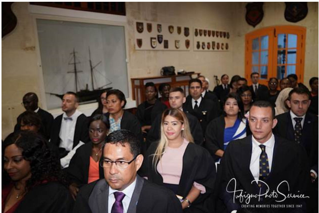
A Cross-section of Students