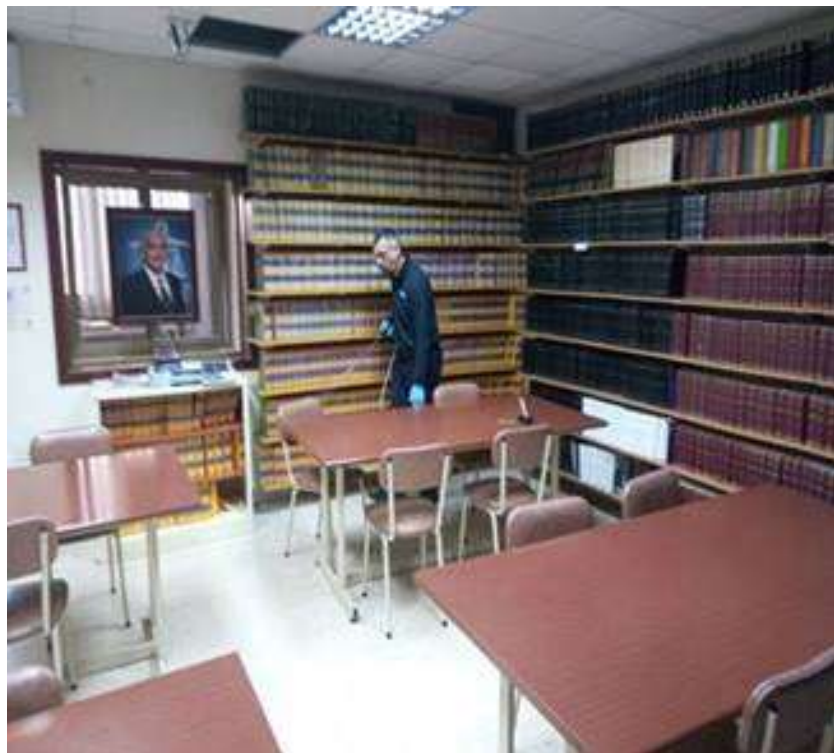
Sterilization of the Library

* If you do not want to receive IMLI e-News in future, please return this message to the above address with request to DELETE in the subject field.