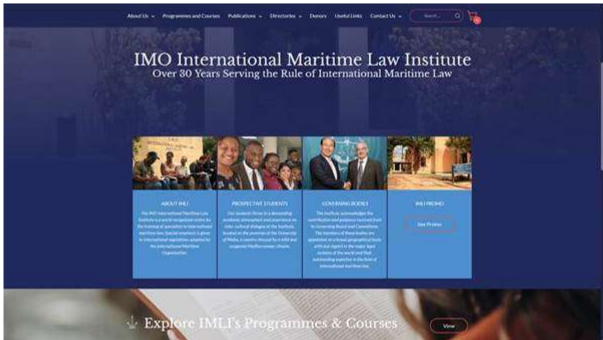
The new IMLI Website homepage