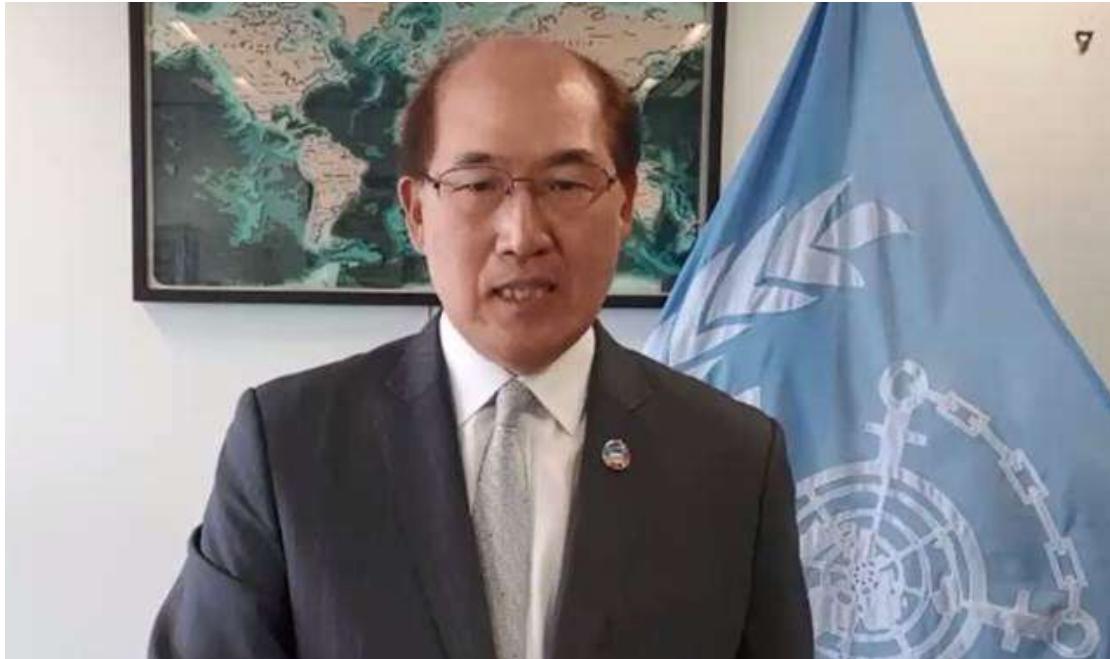
Mr. Kitack Lim (Secretary-General, IMO and Chairman of the IMLI Governing Board) delivering the Graduation Address