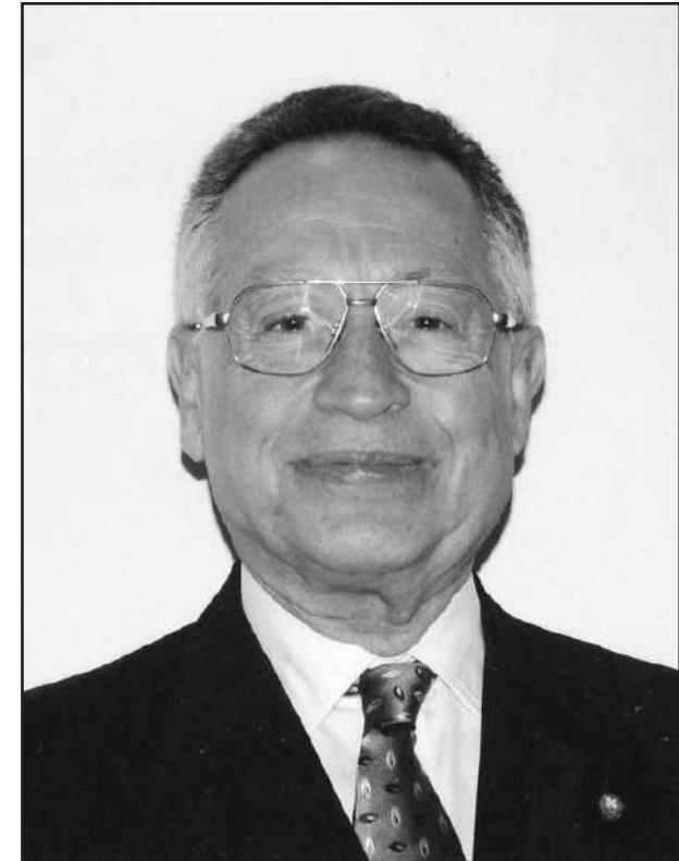
H.E. Mr. Efthimios Mitropoulos Secretary - General, IMO

It is now for you, the Graduating Class of 2005, to maintain the excellent reputation for quality and effectiveness which has been so successfully established by those you succeeded. I wish you every success and good luck and look forward to working together with you to meet the challenges of the future.