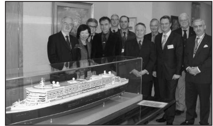
H.E. Mr. Efthimios E. Mitropoulos (Chairman, Secretary-General, IMO) with Members of the IMLI's Governing Board during the Board's 19 th Session held at the IMO Headquarters, London, on the 22 nd April 2005.