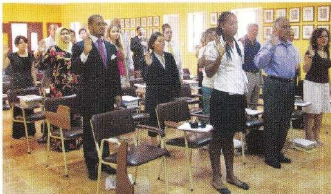
IMLI Class 2007 – 2008 giving the solemn promise at the beginning of the academic year.