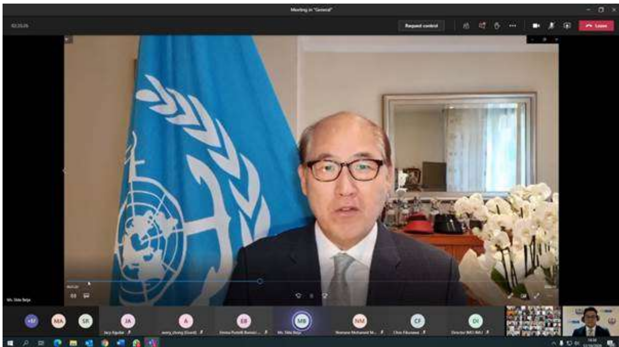
Mr. Kitack Lim (IMO Secretary-General, IMO and Chairman of the IMLI Governing Board) delivering the Welcoming Address

On Monday, 12 October 2020, the IMO International Maritime Law Institute (IMLI) welcomed its 32nd generation students for the academic year 2020-2021. The welcoming address was delivered by Mr. Kitack Lim (IMO Secretary-General, IMO and Chairman of the IMLI Governing Board).