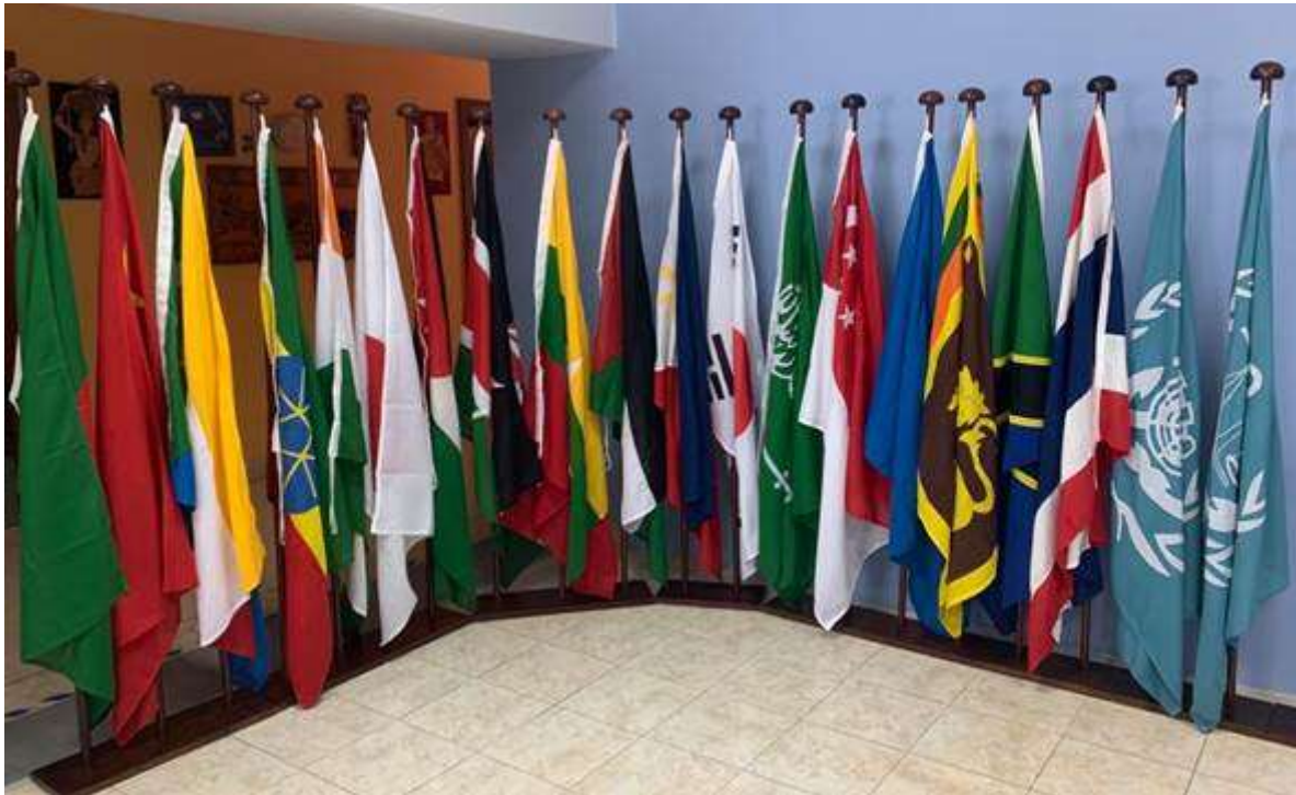
The Flags of the countries East of Malta, represented at IMLI for the academic year 2020-2021