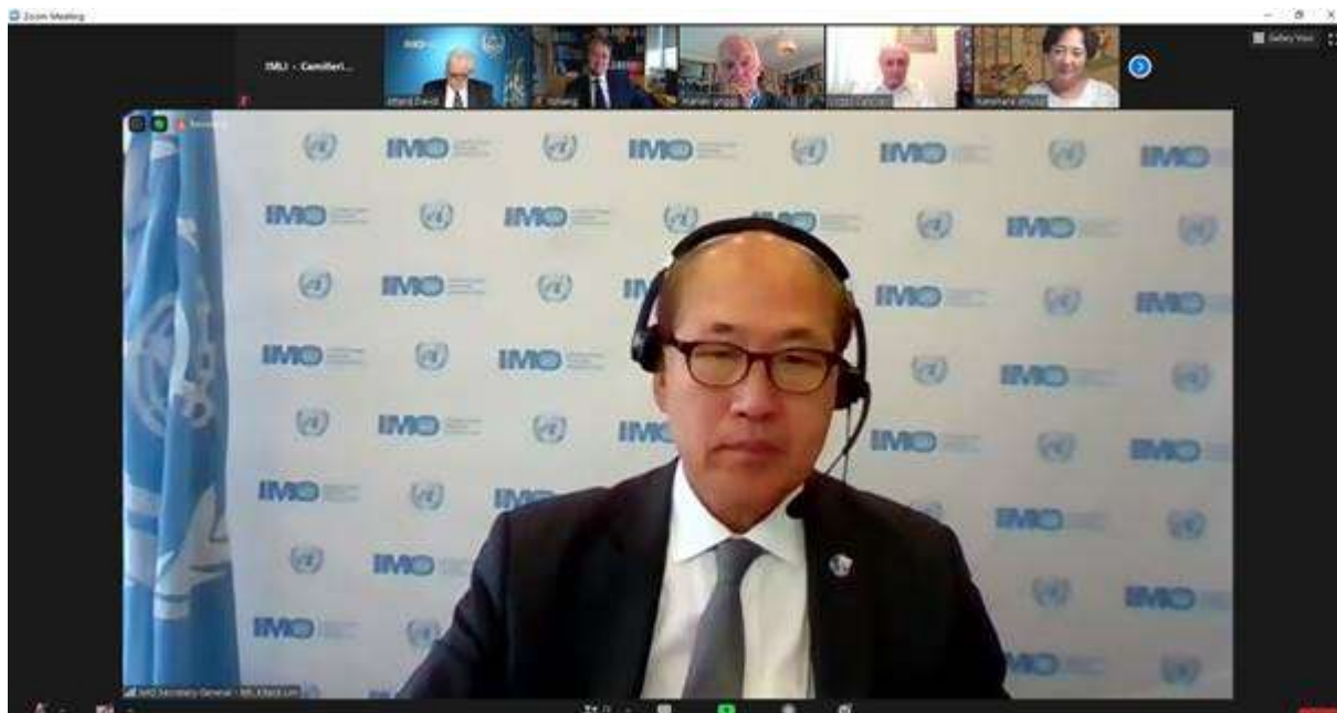
Mr. Kitack Lim (Secretary-General, IMO and Chairman of the IMLI Governing Board) addressing the 35 th Session of the Board

The Governing Board reviewed the Financial and Academic progress of the Institute for the period between 1 June 2020 and 30 June 2021.