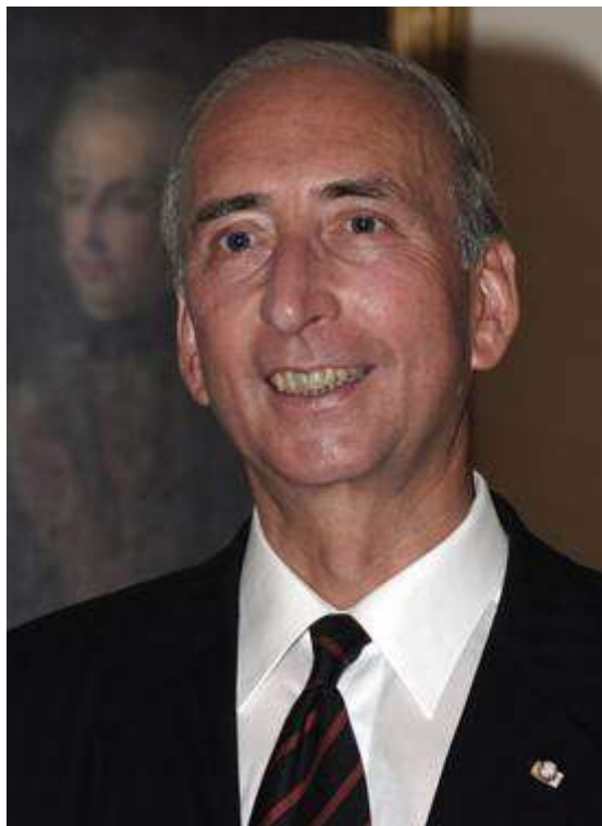
(Former Judge and Vice-President of the International Tribunal for the Law of the Sea (ITLOS))