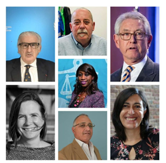
Instructors in the IMLI Specialized Course on Seafarers' Rights

IMLI has been in the vanguard in raising awareness on the importance of maritime labour law standards. IMLI's consistent training of Government nominated officials and its Specialized Course on Seafarers' Rights reaffirm the Institute's contribution to the protection of seafarers in line with the international efforts spearheaded by the IMO and ILO.