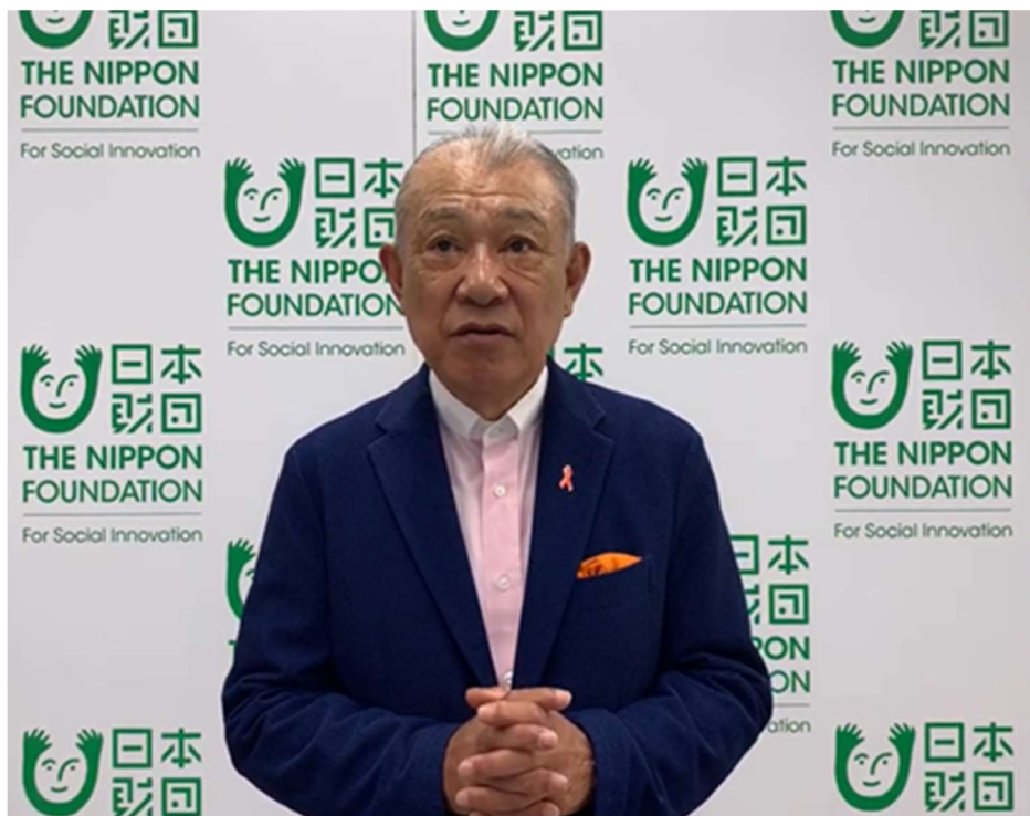
Dr. Yohei Sasakawa (Chairman, The Nippon Foundation) delivering a message during the Institute's 32 nd Annual Graduation Ceremony

Dr. Yohei Sasakawa (Chairman, The Nippon Foundation) delivered a message to the eminent attendees and graduands on the occasion of the Institute's 32 nd Annual Graduation Ceremony held on Friday, 3 September 2021.