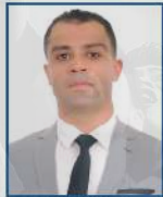
Lt. Col Akram Boubakri (TUNISIA)