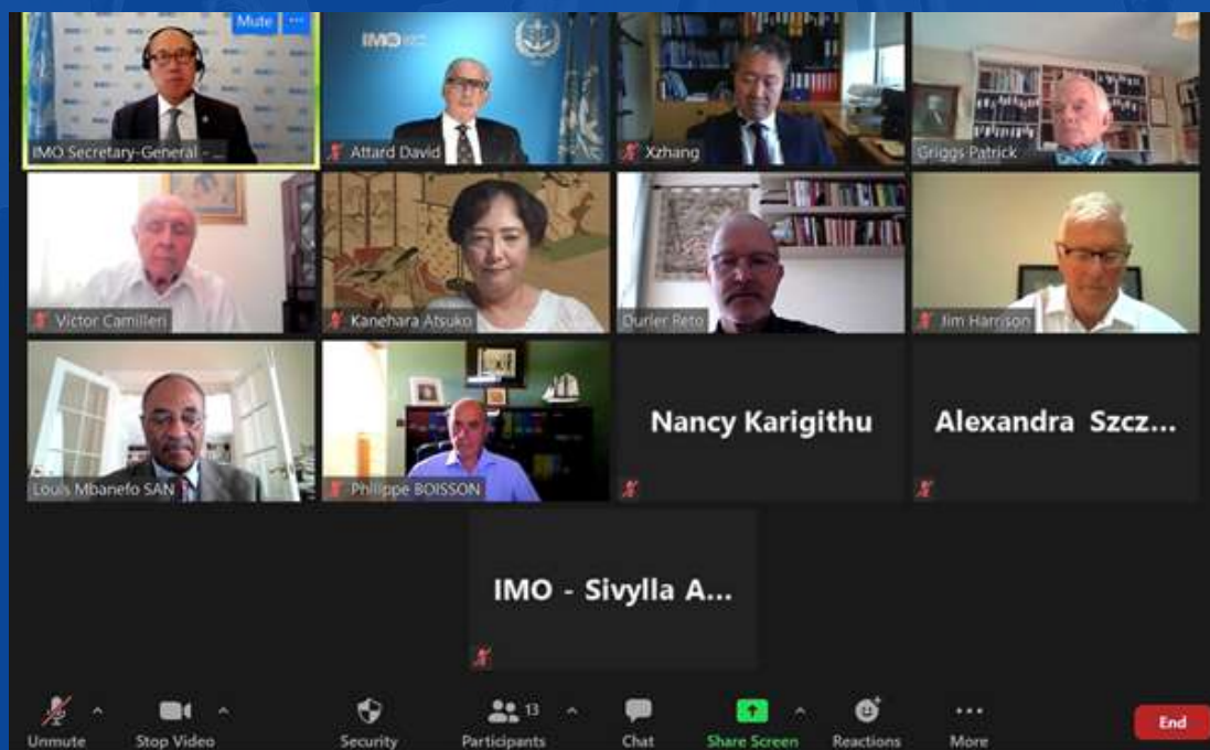
35th Session of the IMLI Governing Board

Mr. E.E. Mitropoulos Secretary-General Emeritus