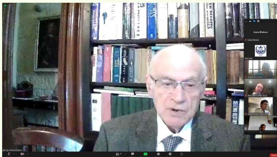
H.E. Dr. Ugo Mifsud Bonnici (President Emeritus of Malta) lecturing to the students of the IMLI Class of 2021-2022

On Friday 29 October, H.E. Dr. Ugo Mifsud Bonnici (President Emeritus of Malta) commenced the delivery of his annual set of lectures on Comparative Law. In his lectures, Dr. Mifsud Bonnici will address the topics of ‘Classification and Differentiation’; ‘The Mainstream of Law in the West’; ‘The Specific Nature of Anglo-Saxon Common Law Systems’; ‘Law in Islamic Countries’, and ‘Law and Change: The Drafting of New Laws’.