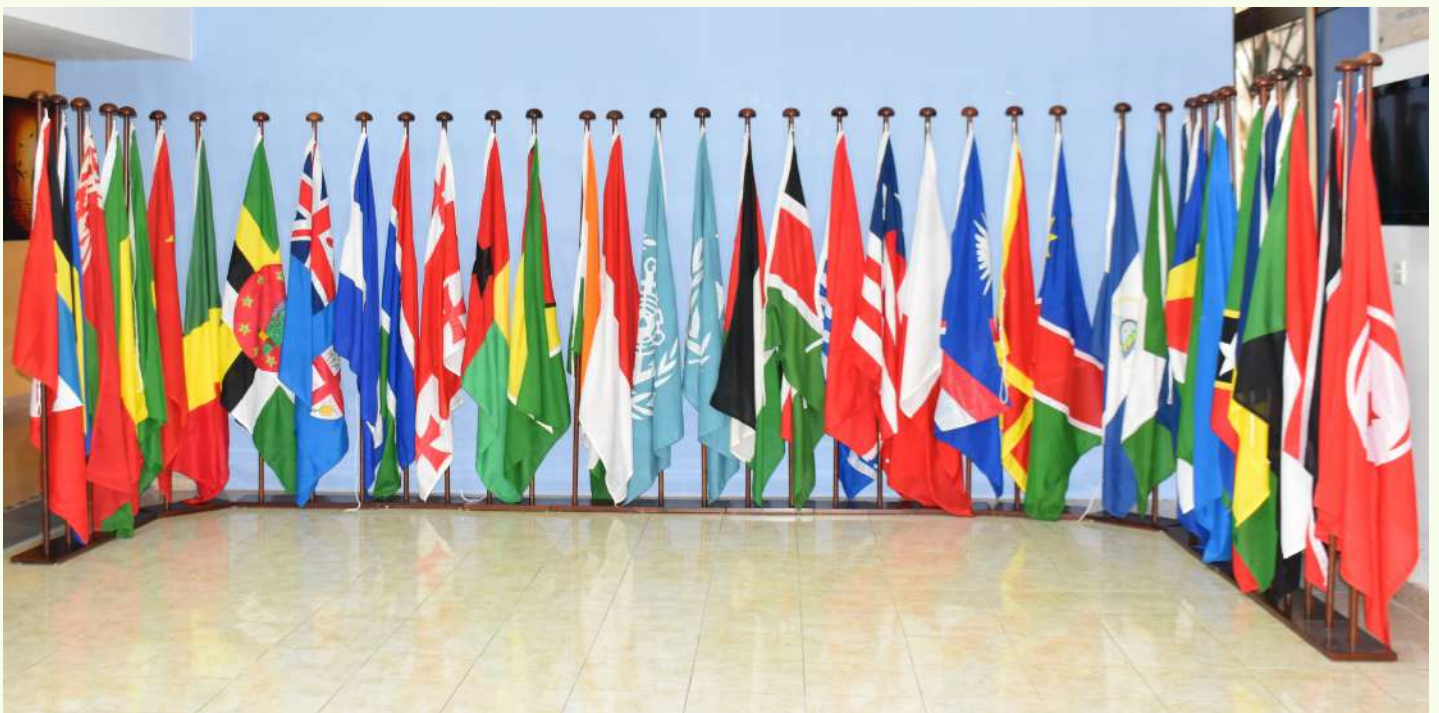
National Flags of the Countries represented at IMLI for the academic year 2021-2022

Subsequently, a student from Ghana has joined one of the Institute's programmes and the flag of Ghana will be hoisted to note the country's representation at IMLI.