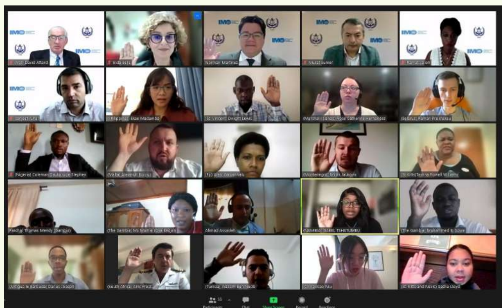
The IMLI Class of 2021-2022 taking the Oath of Allegiance