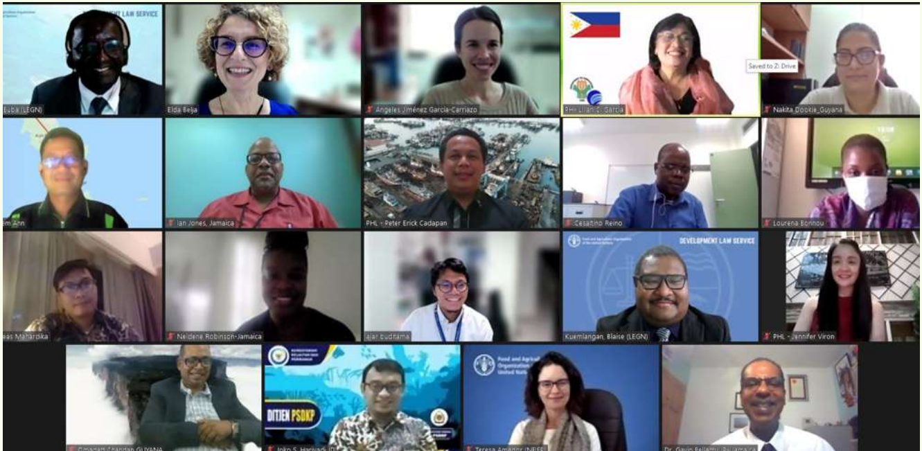
Participants of the FAO – IMLI International Course on Fisheries Law from Cambodia, Guyana, Indonesia, Jamaica, Mozambique, and the Philippines with FAO officers and members of the IMLI Faculty during the Closing Ceremony

The FAO – IMLI International Course on Fisheries Law and the FAO – IMLI Curso Internacional sobre el Derecho de la Pesca have been completed. The Courses were conducted in English and in Spanish respectively from September to November 2021.