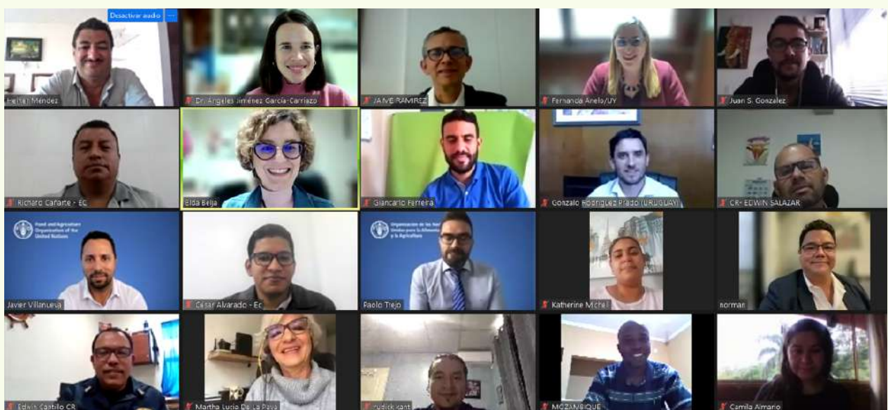
Participants of the FAO – IMLI Curso Internacional sobre el Derecho de la Pesca from Colombia, Costa Rica, Ecuador, Mozambique, Panama, Peru, and Uruguay with FAO officers and members of the IMLI Faculty during the Moot Court presentations

The Courses aim to enhance the participants' knowledge in international fisheries law and governance, with emphasis on the relevant FAO instruments such as the Agreement on Port State Measures to Prevent, Deter and Eliminate Illegal, Unreported and Unregulated Fishing.