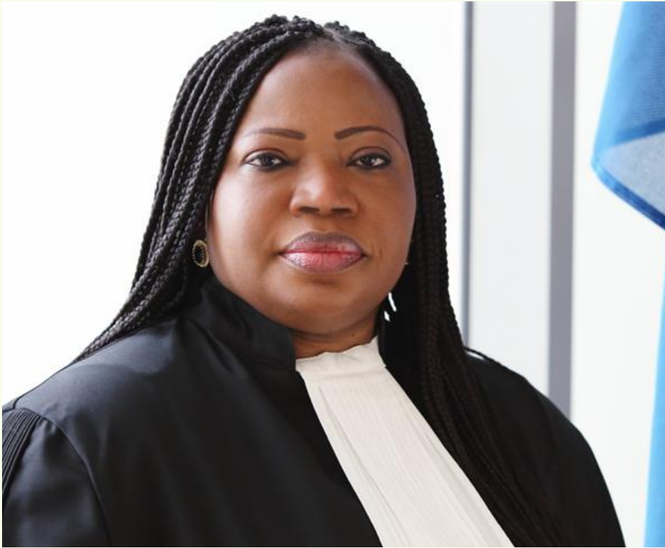
Mrs. Fatou Bomm Bensouda (IMLI Class of 1991 (The Gambia))

The Institute is proud and wishes to congratulate Mrs. Fatou Bomm Bensouda (IMLI Class of 1991 (the Gambia)) for her appointment by the United Nations to head the team that is tasked to investigate alleged violations of human rights during the Ethiopian conflict. Mrs. Bensouda also held, for several years, the prestigious position of Chief Prosecutor of the International Criminal Court (ICC). Prior to this, in addition to other offices held in her country, Mrs. Bensouda was also Attorney-General and Minister of Justice.