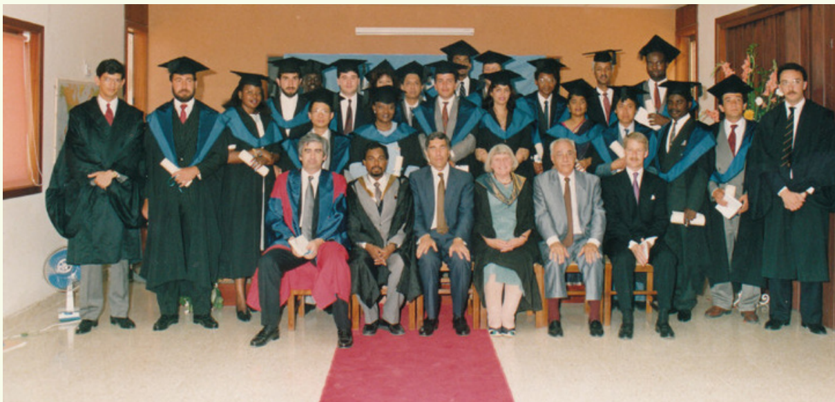
Mrs. Fatou Bomm Bensouda is third from the left of graduands of the IMLI Class of 1991

The Institute is proud and wishes to congratulate Mrs. Fatou Bomm Bensouda (IMLI Class of 1991 (the Gambia)) for her appointment by the United Nations to head the team that is tasked to investigate alleged violations of human rights during the Ethiopian conflict. Mrs. Bensouda also held, for several years, the prestigious position of Chief Prosecutor of the International Criminal Court (ICC). Prior to this, in addition to other offices held in her country, Mrs. Bensouda was also Attorney-General and Minister of Justice.