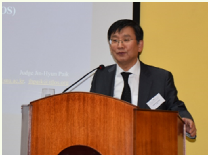
Judge Jin-Hyun Paik (Judge of the International Tribunal for the Law of the Sea (ITLOS)) making his presentation