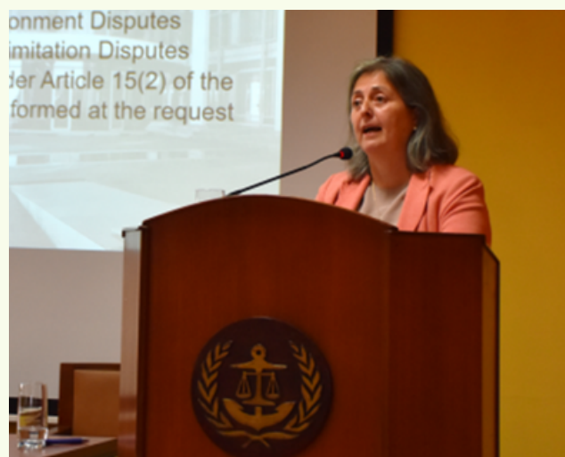
Dr. Ximena Hinrichs Oyarce (Registrar of the International Tribunal for the Law of the Sea (ITLOS))

The Tribunal's workshops aimed to familiarize participants with the dispute-settlement mechanisms established by the United Nations Convention on the Law of the Sea and with the procedure applicable to cases before the Tribunal. To date, workshops have been held in Dakar, Kingston, Libreville, Singapore, Bahrain, Buenos Aires, Cape Town, Fiji, Mexico City, Nairobi, Bali, San José, Mindelo and Montevideo.