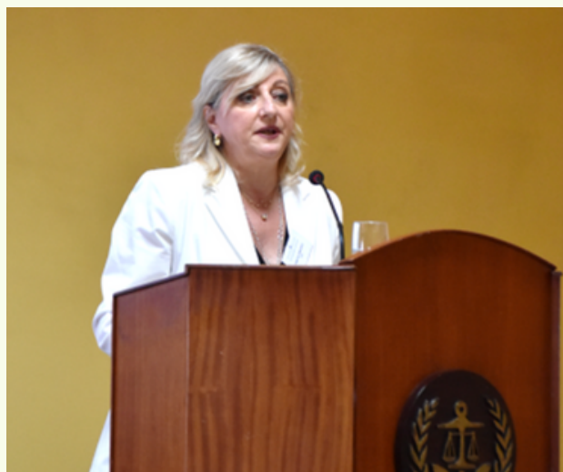
Judge Ida Caracciolo (Judge of the International Tribunal for the Law of the Sea (ITLOS)) during her presentation