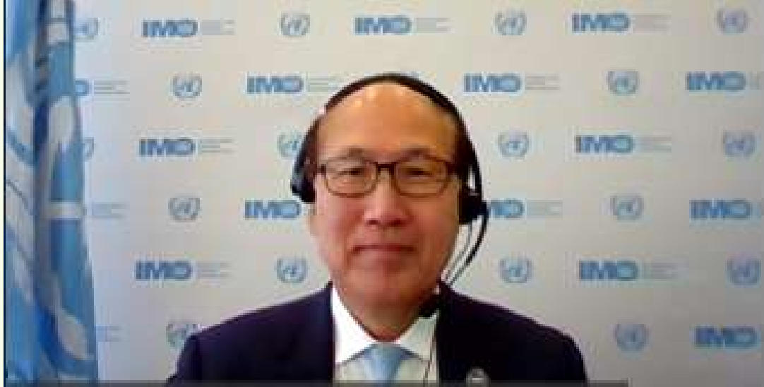
Mr. Kitack Lim (Secretary-General, IMO and Chairman, IMLI Governing Board) addressing the 36th session of the Board

The Board commended the Institute for its financial stability and in particular its net record surplus. It congratulated the Director for his successful fundraising, particularly with respect to attracting new funding and further recorded its appreciation to all the Institute's donors and contributors.