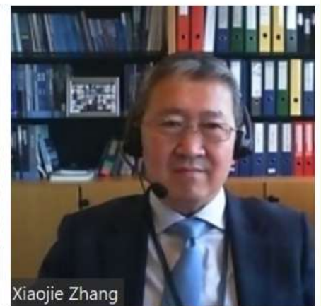
Members of the IMLI Financial and Human Resources Committee (FINCOM)