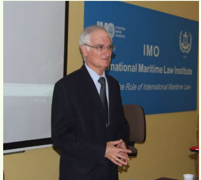
Ambassador Saviour Borg lecturing at IMLI

From August 2007 to January 2012, he served as the Permanent Representative of Malta to the United Nations in New York, also serving as the Rapporteur of the United Nations Committee on the Inalienable Rights of the Palestinian People. Ambassador Borg was instrumental in the recognition by the UN General Assembly of the Institute's capacity-building role for the benefit of the international community. IMLI records with pride that such recognition has continued to be extended for the last 13 years.