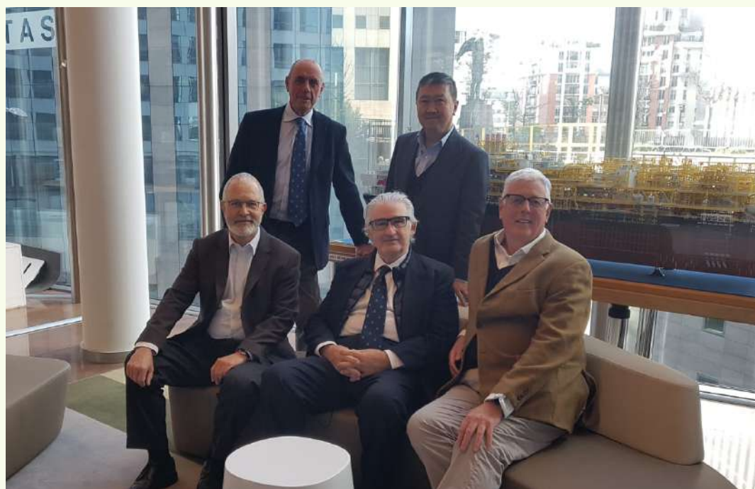
IMLI's Financial and Human Resources Committee (FINCOM)