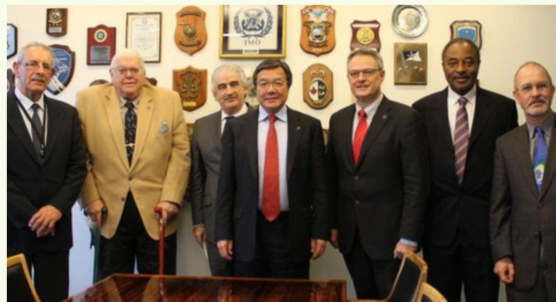
2015 Governing Board Session held at IMO