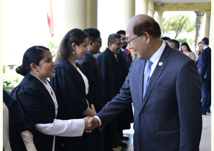
Mr. Kitack Lim (IMO Secretary-General and Chairman of the IMLI Governing Board) meeting the members of the IMLI Graduating Class of 2022-2023