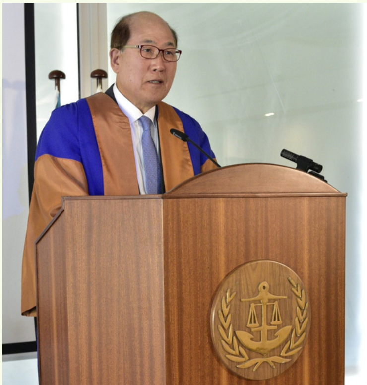
Mr. Kitack Lim (IMO Secretary-General and Chairman of the IMLI Governing Board) delivering the 2023 Graduation Address