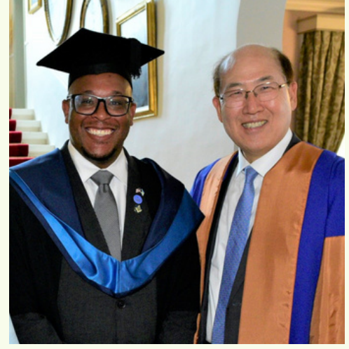
Mr. Kitack Lim (IMO Secretary-General and Chairman of the IMLI Governing Board) with some members of the IMLI Class 2022-2023