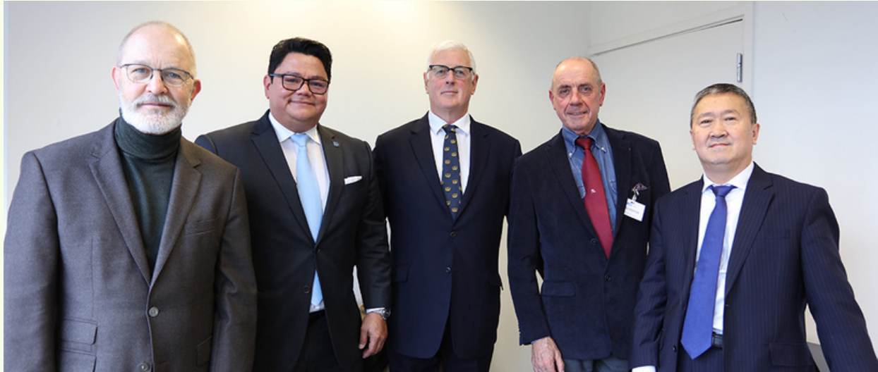
IMLI Financial and Human Resources Committee