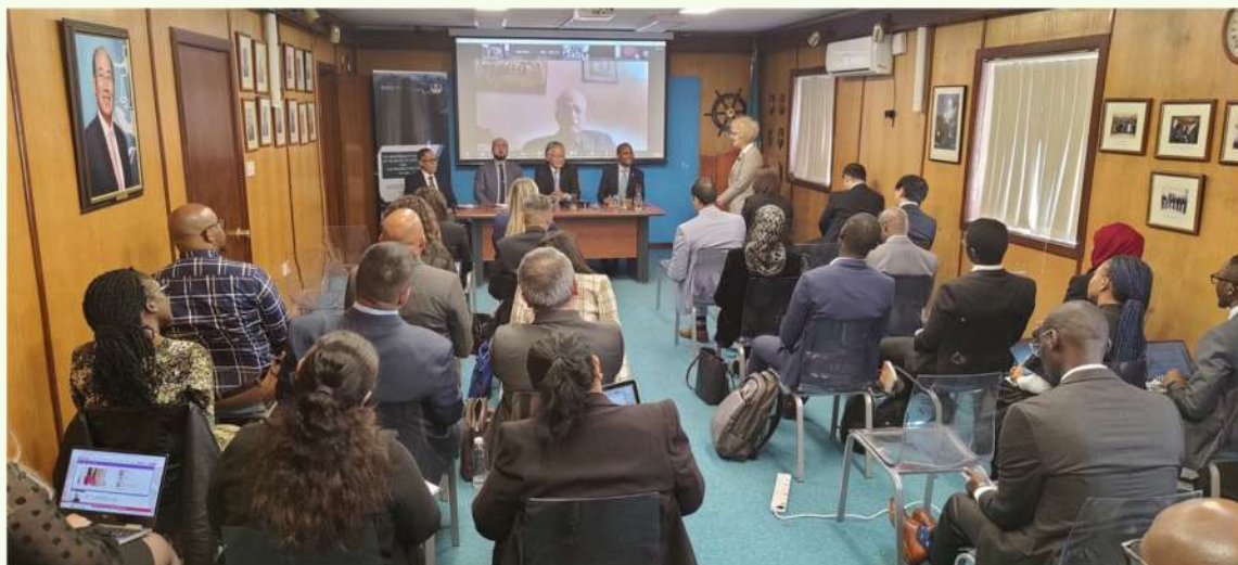
Round Table Discussion