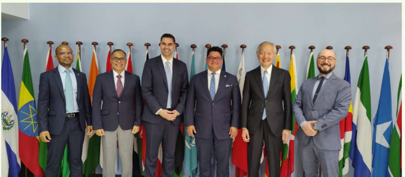
The Speakers at the Seminar