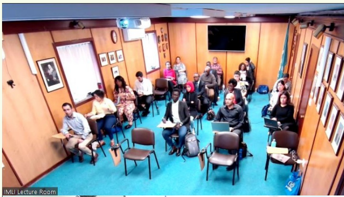
IMLI Lecture Room