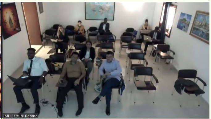
IMLI Lecture Room2