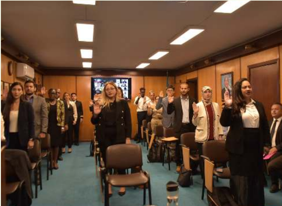
Class of 2022-2023 taking the Oath of Allegiance to the IMO International Maritime Law Institute