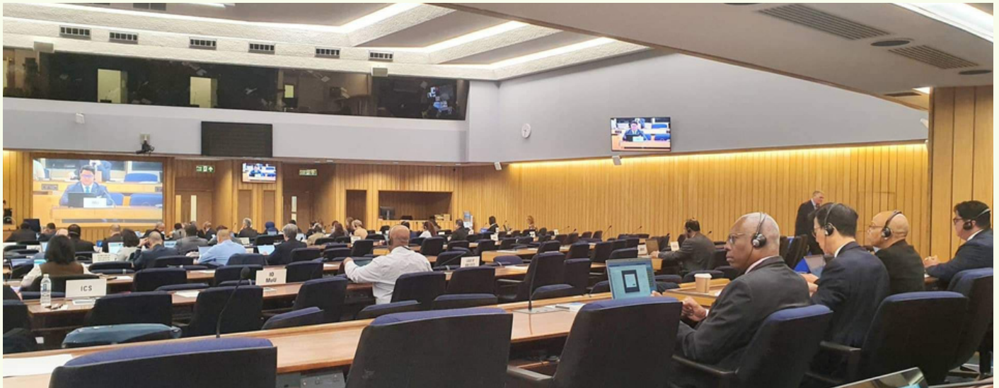
Representatives of Member States