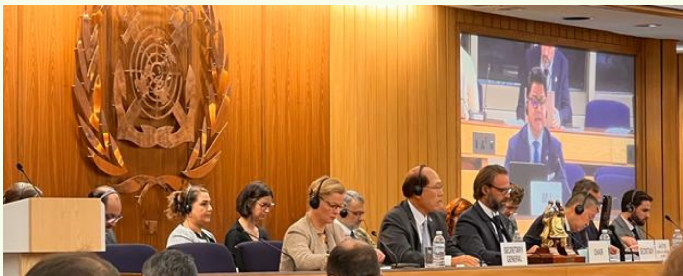
Distinguished Members of the IMO Technical Cooperation Committee

The Director concluded his address with a pledge to work unrelentingly to take the Institute to new academic heights and to work together with IMO so that IMLI can contribute in a more direct manner to the delivery of the Integrated Technical Cooperation Programme's objectives.