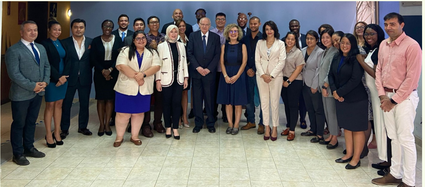
H.E. Dr. Ugo Mifsud Bonnici (President Emeritus of the Republic of Malta) with Members of the Faculty and Students of the Class of 2022-2023

In his lectures, H.E. Dr. Mifsud Bonnici will be addressing the topics of "Classification and Differentiation"; "The Mainstream of Law in the West"; "The Specific Nature of Anglo-Saxon Common Law Systems"; "Law in Islamic Countries", and "Law and Change: The Drafting of New Laws".