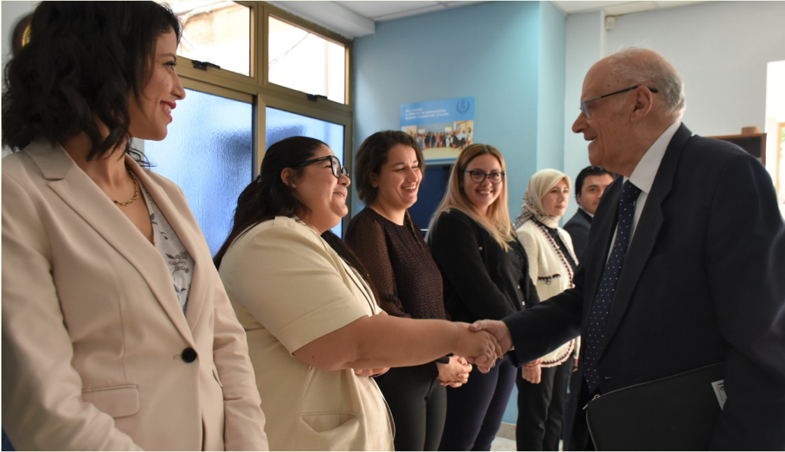
H.E. Dr. Ugo Mifsud Bonnici (President Emeritus of the Republic of Malta) meeting Students of the Class of 2022-2023

On Friday 28 October 2022, H.E. Dr. Ugo Mifsud Bonnici (President Emeritus of the Republic of Malta) commenced his annual lectures on " Introduction to Comparative Law " to the IMLI Class of 2022-2023.