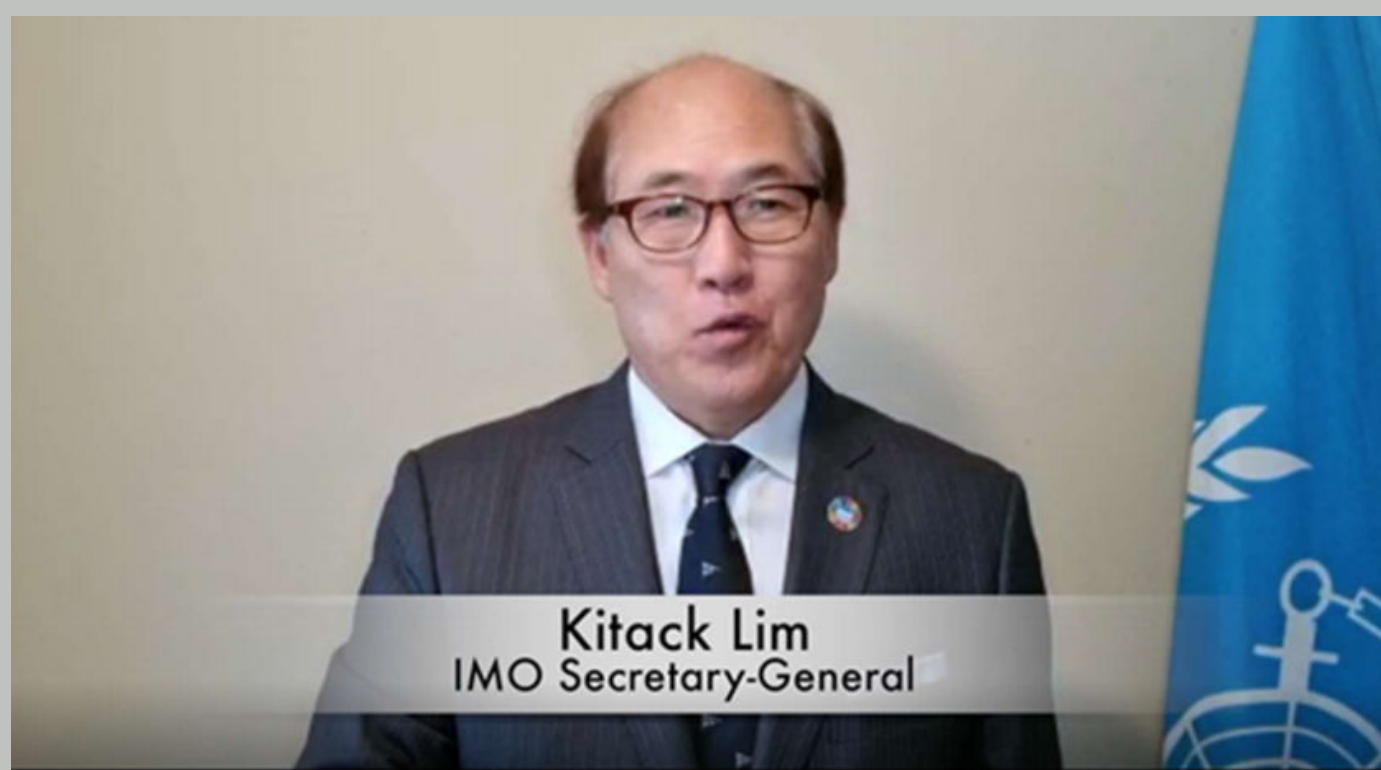
Mr. Kitack Lim (Secretary-General, IMO) delivering the Welcome Message to the participants of the IMLI Course on the Law of Ports

Cognizant of the fact that a robust port system which embraces advancements in technology, including automation and digitalization, while ensuring safety, security and environmentally friendly activities contributes to sustainable development, the Institute will offer for the fourth time the IMLI Course on the Law of Ports with the aim to elaborate on the legal regime governing port operations and highlight the vital role of IMO therein.