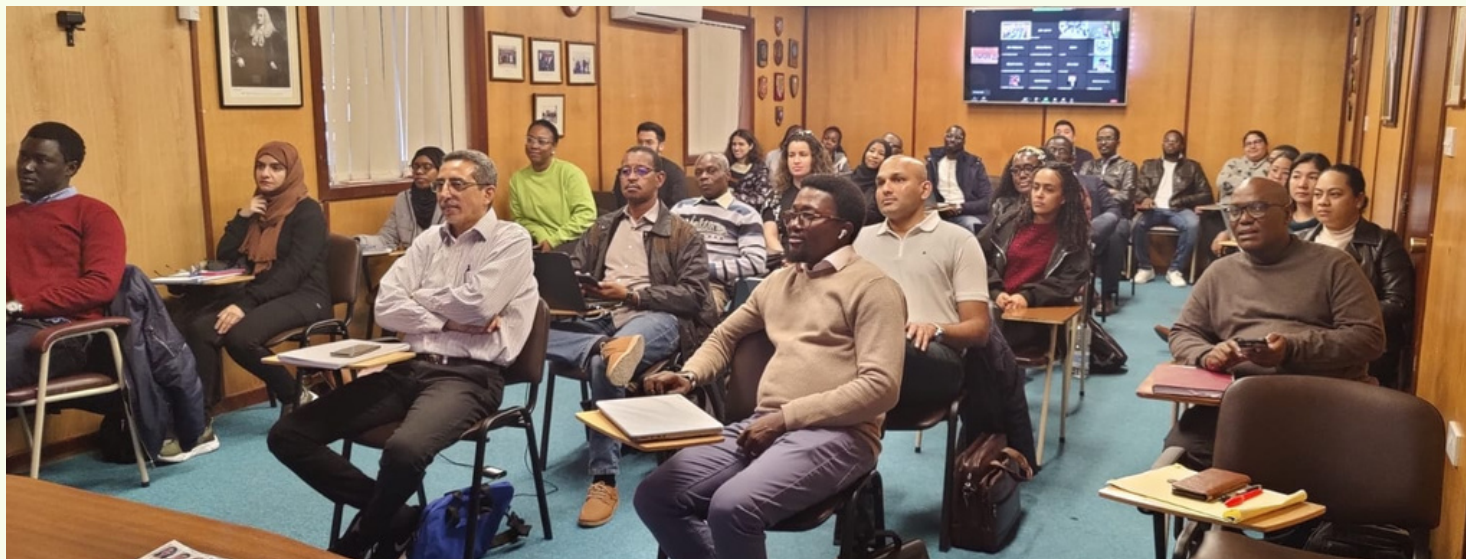
IMLI Class of 2022-2023 attending the Symposium online

IMLI students of the Class of 2022-2023 had the privilege of attending online the IMO Symposium on "Maritime Single Window 2024 - Window of opportunities for shipping and ports" held between Wednesday 18th and Thursday 19th January 2023 at the IMO Headquarters in London.