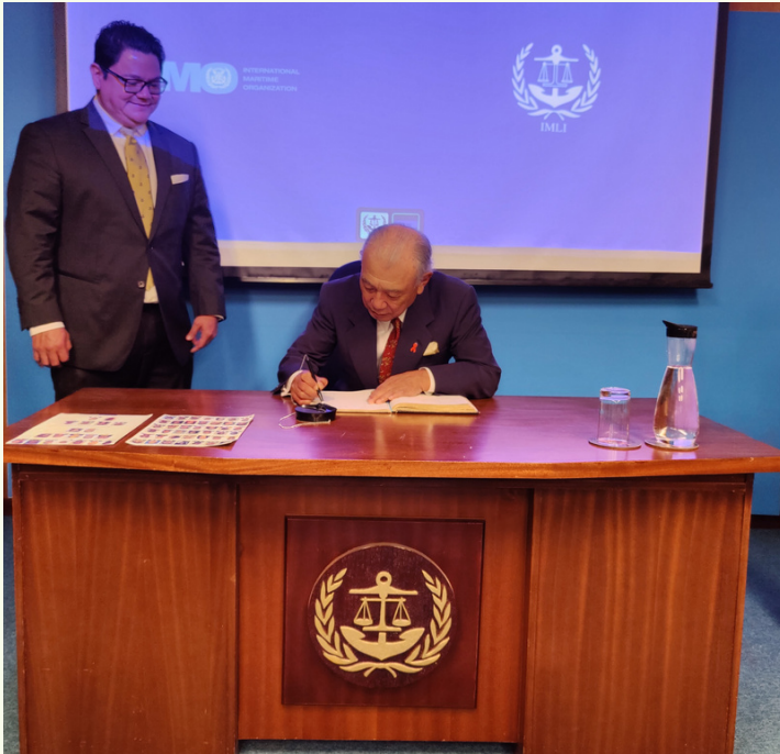
Dr. Yohei Sasakawa (Chairman, The Nippon Foundation) signing the IMLI Guest Book