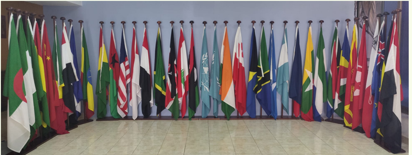
National Flags of the Countries represented at IMLI for the Academic year 2022-2023

The flags of these countries will adorn the Institute's premises throughout the academic year.