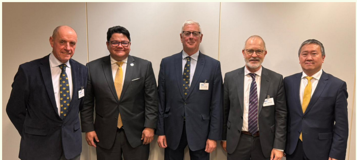
The IMLI Financial and Human Resources Committee (FINCOM)

The IMLI Financial and Human Resources Committee (FINCOM) met for the second time during the year 2023. Meeting was held on Friday 7 December 2023 at the IMO Headquarters in London.