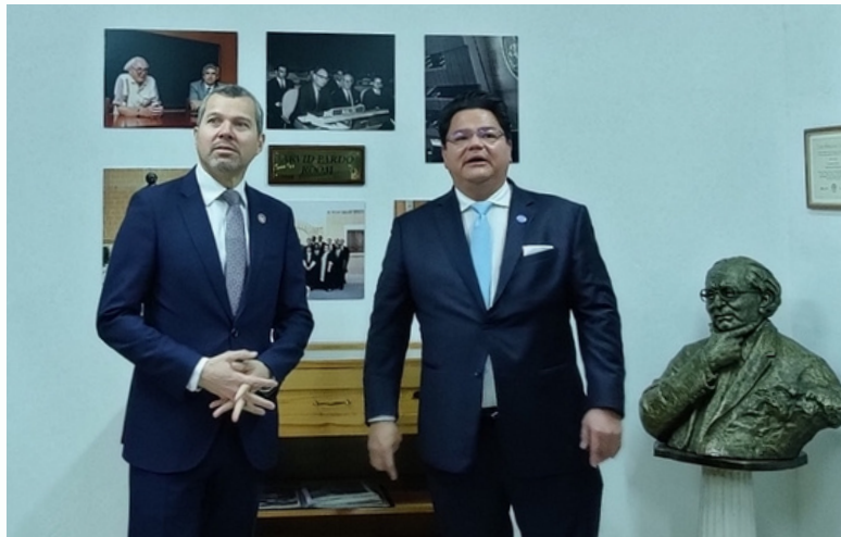
The IMO Secretary-General being shown the Arvid Pardo Room which was inaugurated in December 2022 on the occasion of the 40th Anniversary of the adoption of UNCLOS

After his formal introduction to the Class by the IMLI Director, the IMO Secretary-General was then given a tour of the newly refurbished IMLI premises which included the lecturing facilities, Staff offices and students' accommodation.