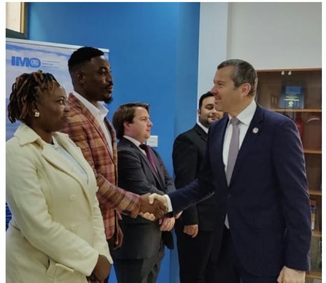
The IMO Secretary-General meeting the students of the Class of 2023-2024