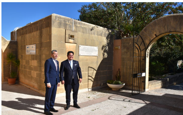
The IMO Secretary-General being given a tour of the IMLI premises