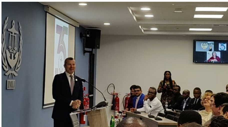
The IMO Secretary-General addressing the IMLI Class of 2023-2024

Following the tour of the premises, the Secretary-General then proceeded to deliver his address to the IMLI Class of 2023-2024 in the Lecture Hall.