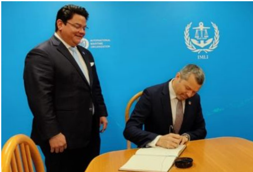
The IMO Secretary-General signing the IMLI Visitors' Book