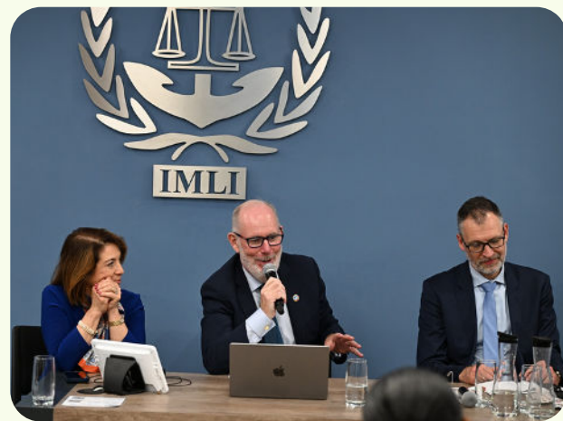
Round Table Discussion

This Specialized Course which focused on the protection of the marine environment within the integrated global governance of the various maritime activities, expanded further the Institute's mission in enhancing capacity-building for a sustainable use of the oceans, in line with all SDGs, particularly SDG 14.