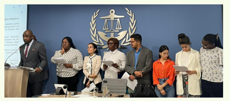
A few of the Working Groups that presented the National Maritime Transport Policy outline at the end of the Seminar